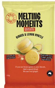
Ginger and Lemon Myrtle