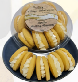
MELTING MOMENTS VANILLA