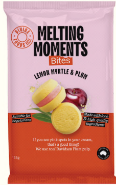
Lemon Myrtle and Plum