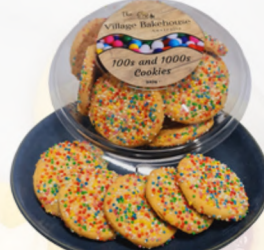
100'S AND 1000'S