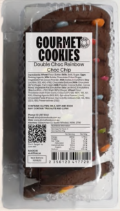
100mm Diameter 60 grams 11 in a pack