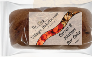
CARROT AND WALNUT