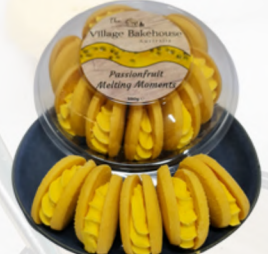
MELTING MOMENTS PASSIONFRUIT