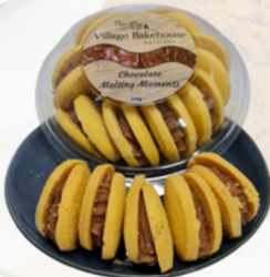
MELTING MOMENTS CHOCOLATE