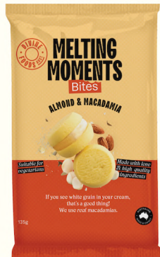
Almond and Macadamia