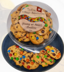
YOUNG AT HEART