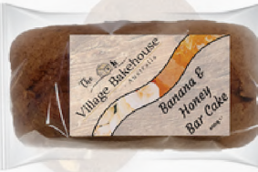
BANANA AND HONEY