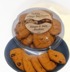
GINGER AND DATE