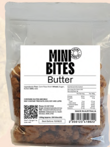
30mm Diameter 5 gram each cookie ~200 in each pack 1KG pack