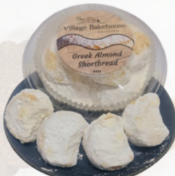
GREEK ALMOND SHORTBREAD