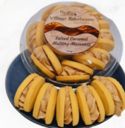
MELTING MOMENTS SALTED CARAMEL