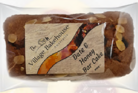
DATE AND HONEY