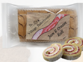
JAM AND CREAM